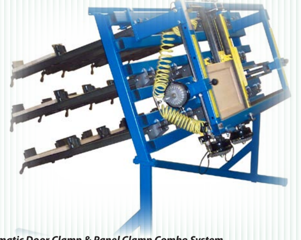
Pneumatic Door Clamp & Panel Clamp Combo System