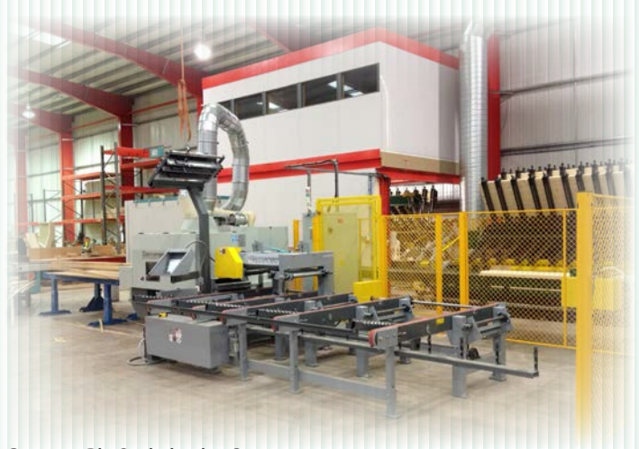
Cameron Rip Optimization System