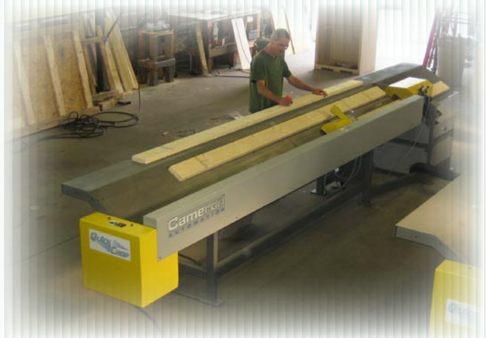
Push Feed Chop Systems