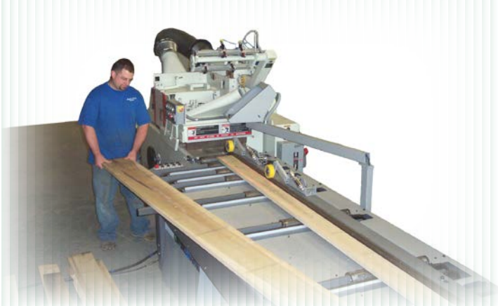
Rip Optimization for the Custom Shop