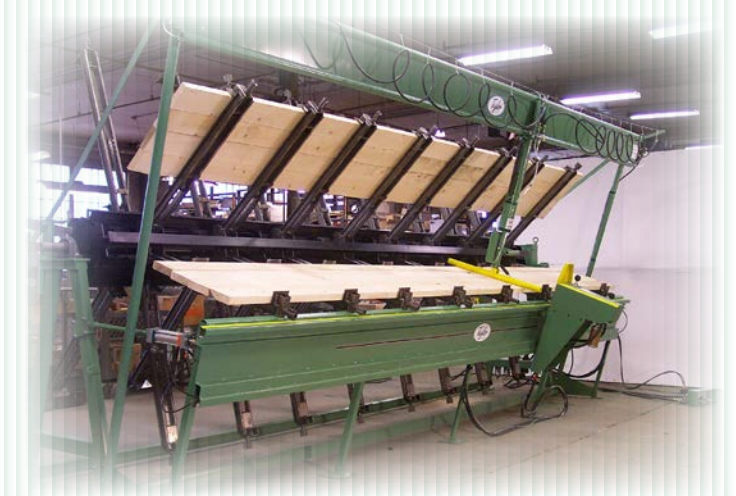
Custom Shop Clamp Carrier For Long Stock - 16' Rail & Posts