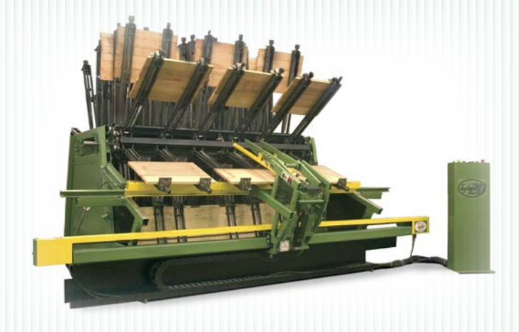
Taylor Hydraulic Automated Clamp Carrier