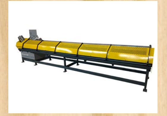
Push Feed Chop Systems