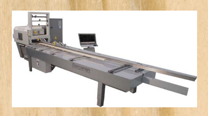
Rip Optimization for the Custom Shop