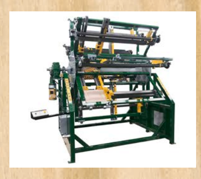
Taylor Door Pros