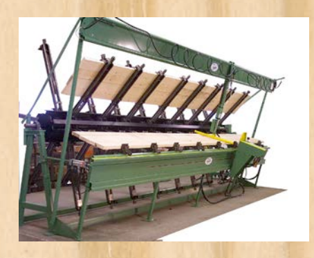
Taylor Clamp Carriers