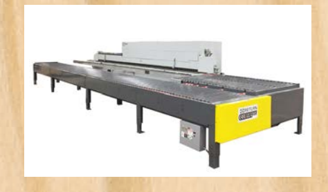
Taylor Return Conveyors